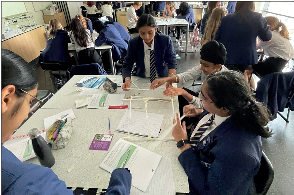
HS2 Engineering Workshop