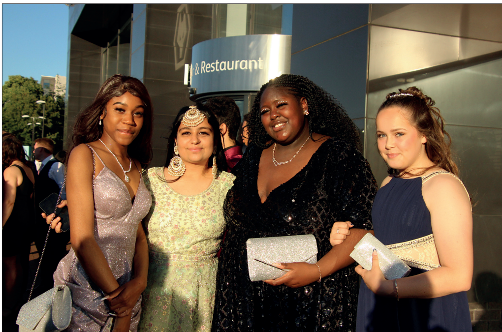
Year 11 Prom

"I've only been at Heath Park for two weeks and I feel like I know the school as if it were my own home. It feels like I've been here for two years, not two weeks" Year 7 student